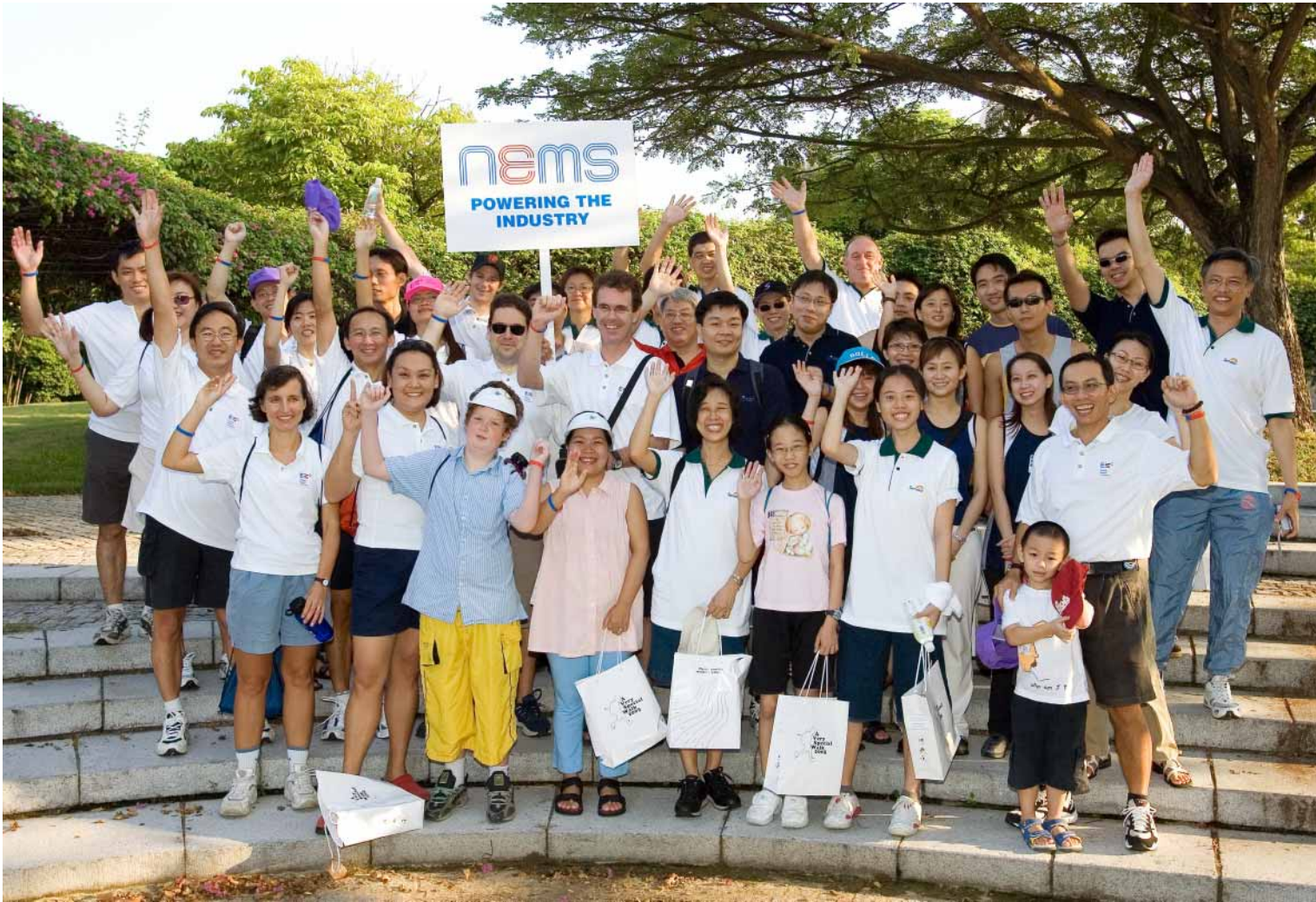
NEMS was one of the most visible industry groups