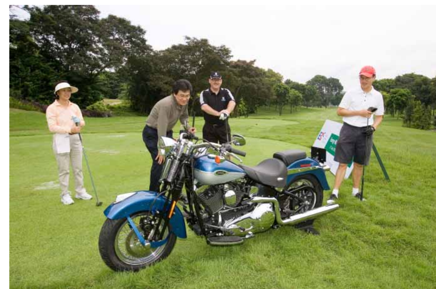
Unclaimed hole-in-one prize

This year we presented our new EMC Challenge Trophy to the winning team. This sterling silver trophy is bound to become a coveted prize for future tournaments. Much to the dismay of the players, our Hole-in-One prize of a Harley-Davidson Softail motorcycle, sponsored by Harley-Davidson, went unclaimed.