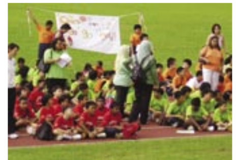
Getting ready for the Telematch

and different coloured t-shirts for each of the teams. To ensure that there will be another sports day to foster camaraderie among the students, EMC will sponsor this year's event on 6 July, and our staff will volunteer and compete in some of the events.