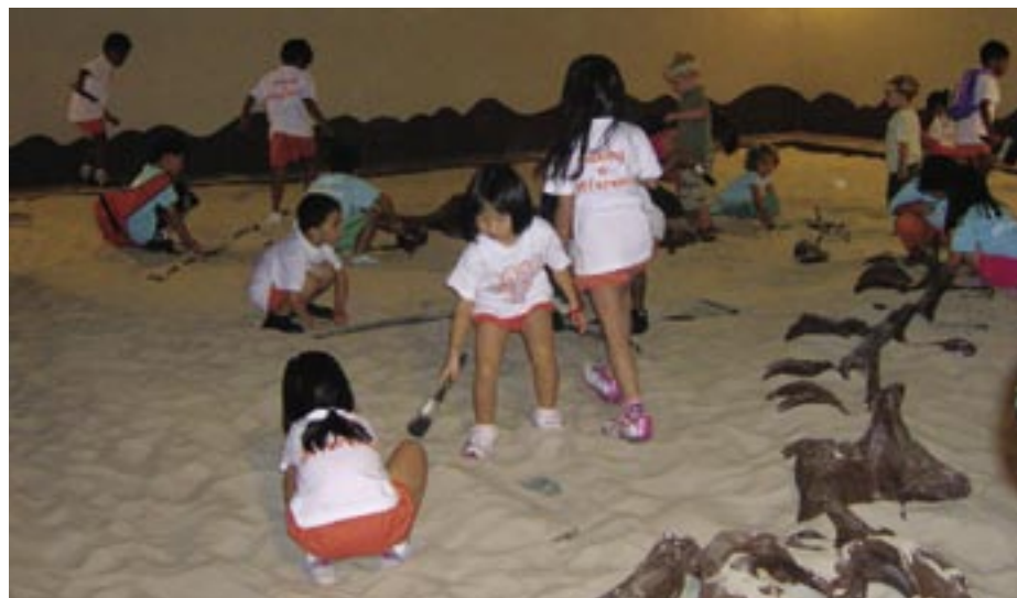
Fossil hunt at the Science Center

With our last financial year complete, it is time to reflect on the support that our corporate social responsibility programme (CSR) and the NEMS charity programme have given to four charitable organisations.