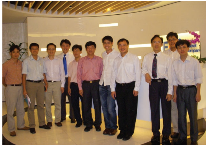
Delegation from Vietnam with EMC staff