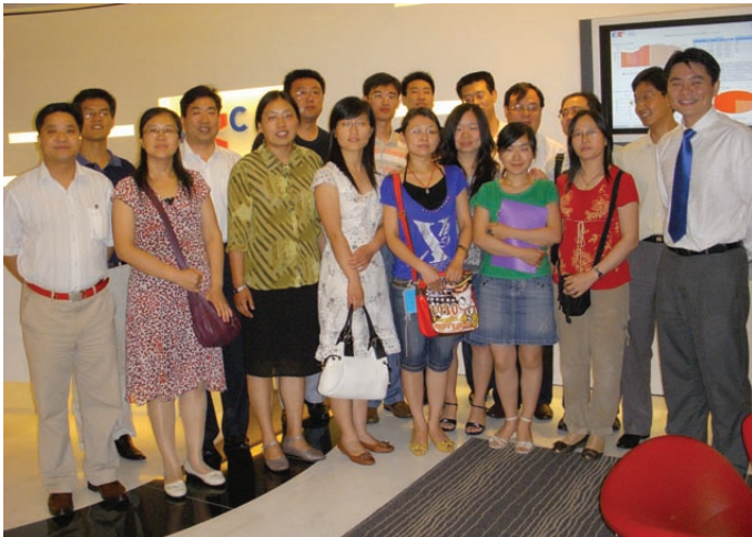
Delegation from China with EMC staff

In addition to these two delegations, EMC has given presentations to several interested visiting parties in the past year, all here to learn more details on how the Singapore market functions and performs.