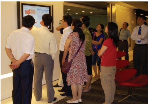
EMC staff explaining to our visitors from Shandong the daily trading prices that are displayed in real time at EMC's office lobby