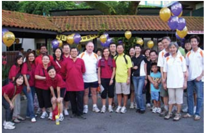
The NEMS group

In the future, we hope to include other electricity industry participants in this NEMS charity initiative, so please contact us or any of the other two companies if you would like to find out more.