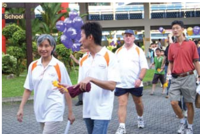
Walk around the block