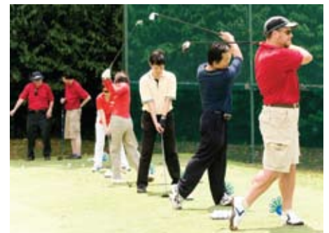
Novice and beginning golfers at the golf clinic

This was the fourth year in a row that we had invited four of Singapore's leading junior lady golfers to participate in this event, as part of our conscientious efforts to support the development of young golfers through the Singapore Ladies Golf Association (SLGA). Our guests were delighted to play with these rising stars and to see a mixture of familiar and new faces. It is always with wonder that we note how impressive these young ladies play for their age and how much they have progressed in their skills and techniques over the preceding year.