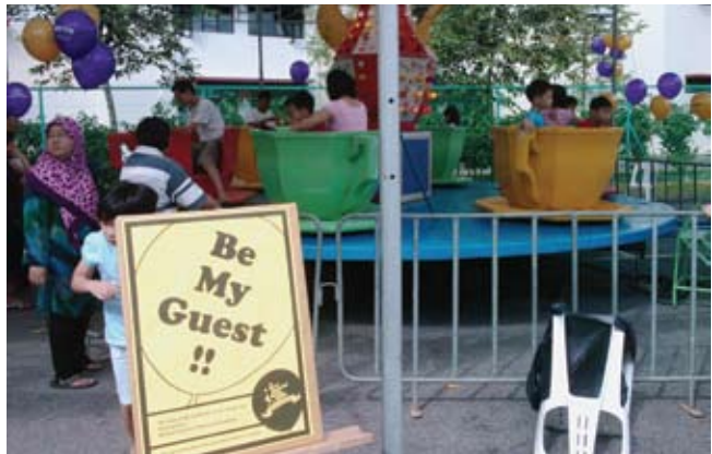
The teacup ride sponsored by the NEMS