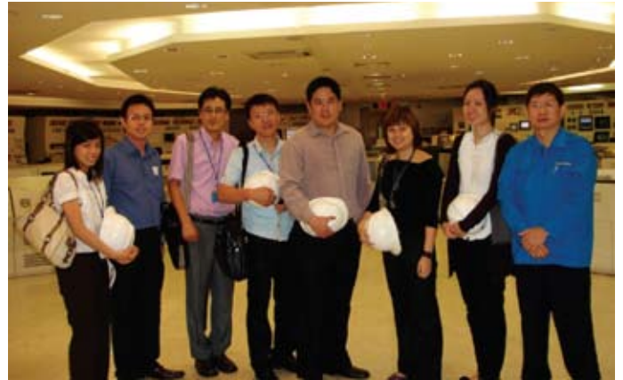
Korean delegates take an on-site plant tour at PowerSeraya.

The EMC Market Operations team brought the delegates through topics in market operations and pricing and settlements in the NEMS, while the Market Administration team covered the intricacies of the vesting contract regime in Singapore—a topic of particular interest to the delegates. In addition to the in-depth lectures, PowerSeraya Ltd kindly hosted the delegates and a few EMC staff for an on-site plant tour.