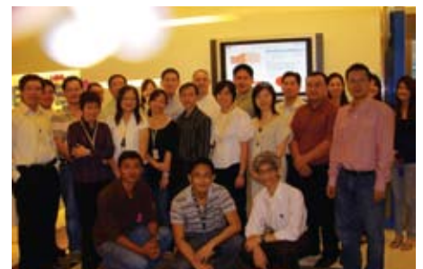
DMS contacts attending the workshop

that they would be interested to attend more workshops like this. The workshop was also a great opportunity for DMS contacts to network and build good working relationships with their industry counterparts.