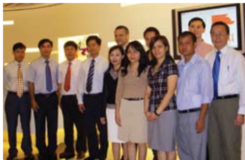
Delegation from ERAV (Vietnam) with EMC staff

A delegation from the Electricity Regulatory Authority of Vietnam (ERAV) visited Singapore for a week in May to exchange ideas on market design and operational issues and to learn from Singapore's experience in market operation, system operation, metering and reconciliation, generator trading, new investment, tariff and fee determination, and regulatory oversight.