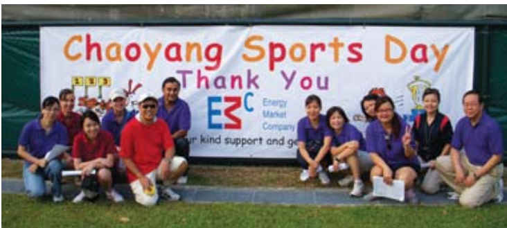
EMC Volunteers at the Chao Yang Sports Day

EMC celebrated Chao Yang School's fourth annual Sports Day on 14 August.