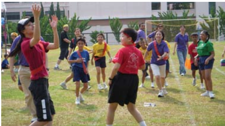
Chao Yang Sports Day – Telematch