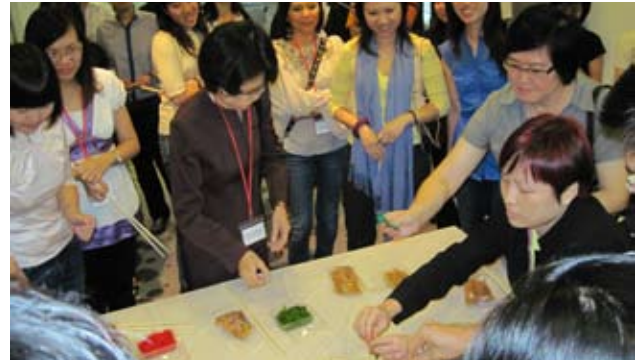
Chinese New Year Lo Hei celebration with market participants from the seminar