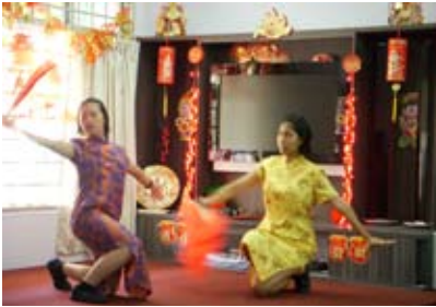
Dance performance by SIA-MINDS

On 16 February, EMC volunteers celebrated Chinese New Year with