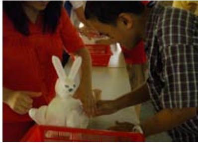
Putting together the rabbit in the race

A mini dragon dance kick-started the song and dance performances by the clients from both SIA-MINDS