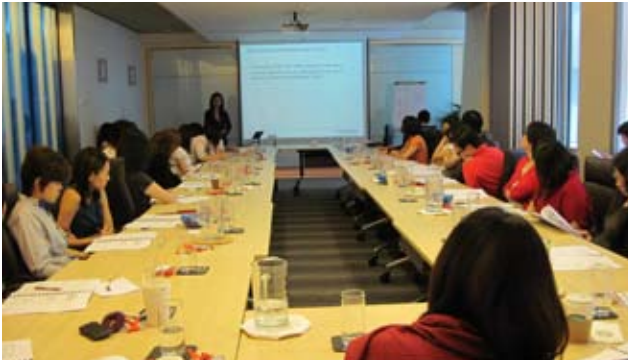
Market participants attending the seminar

As part of EMC's ongoing efforts to engage market participants and share knowledge and information, EMC hosted a Corporate Tax and GST information session on 11 February 2011 for the market participants. The following topics were covered: