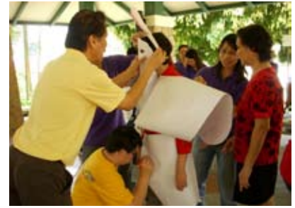
Dressing up the finest looking rabbit

and MINDS AMK. This was followed by the highlight of the celebrations: a string of tele-match games at the multi-purpose hall located close to the centre. First the clients had to compete in a race to put together a