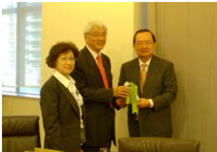
EMC Chairman (center) with Malaysian Minister of Energy, Green Technology and Water (right) and accompanying official (left)