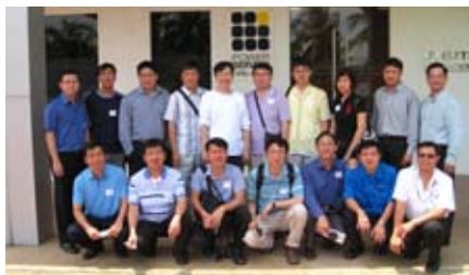
KPX delegates at PowerSeraya plant

implemented in Singapore. The Korean delegation's interest in vesting contracts stems from a potential implementation of them in Korea in the near future. While the design of the Korean electricity market is quite different from Singapore's, the principles of vesting contracts are the same, and course participants gained valuable insights.