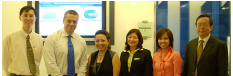
EMC delegates with officials from the Philippine Department of Energy