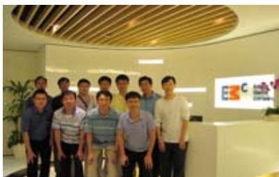
KPX delegates at EMC office

Following last year's customised course for the Korea Power Exchange (KPX), EMC conducted another course in October 2010 for KPX and its member companies. This year, KPX brought along eight member companies from their generation subsidiaries and KEPCO (Korea Electric