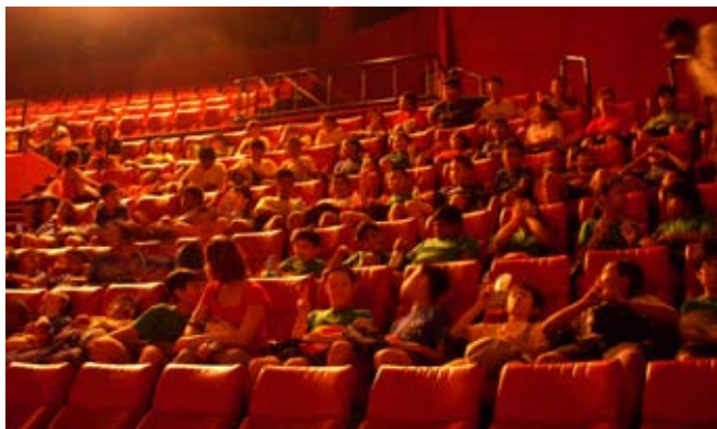
Children getting ready for their IMAX movie

On 30 September, EMC volunteers brought 58 children from Chao Yang School to the Omni Theatre at the Science Centre to watch "The Beaver".