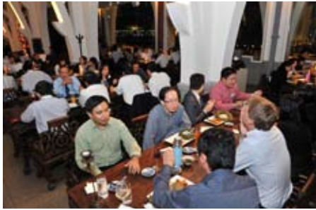
Participants at cocktails and dinner

acknowledged that nuclear power was an energy option that Singapore would not be able to ignore in the long term. The panel also agreed that the benefits of closer regional coordination and integration between countries on energy issues were important and that Singapore should look at the possible benefits arising from such partnerships.