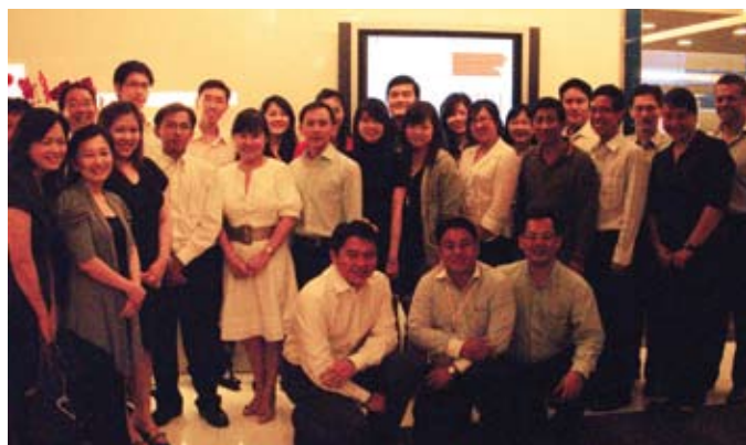
DMS contacts attending the workshop

On 15 July 2010, EMC held a workshop on "Getting the Most out of a Dispute" for the dispute management system contact persons (DMS contacts) for all market players in the NEMS.