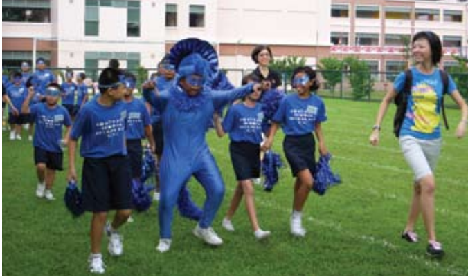
Sports Day Mascot – Blue Dino

EMC celebrated Chao Yang School's fifth annual Sports Day on 16 July. Chao Yang School, under the auspices of the Association for Persons with Special Needs (ASPN), caters to the needs of people with learning disabilities. This is the fifth year EMC sponsored the sports day, from