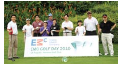
9-hole game players

As always, the highlight of the dinner event was the much-anticipated prize presentation for the lucky draw winners and