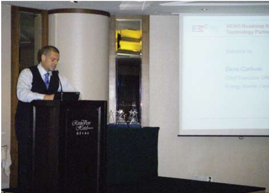
EMC CEO addressing technology partners at the sharing session