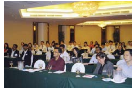
Technology partners at the sharing session