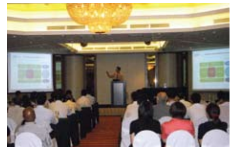
SVP MOIT, sharing the business plans

On 23 March, EMC met with close to 50 technology partners for a sharing and networking session at the Riverview Hotel. The Market Operations and Information Technology (MOIT) team presented the 2010–2013 IT roadmap for the NEMS. The session, first started in 2009, was designed to provide our technology partners with a better understanding of our upcoming business needs, and to encourage more IT synergies between EMC and our tech partners. EMC also took the opportunity to present appreciation awards to partners who had gone the extra mile this past year to help EMC achieve its NEMS IT roadmap targets.