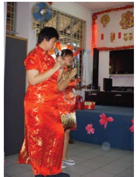
Singing performance by MINDS AMK