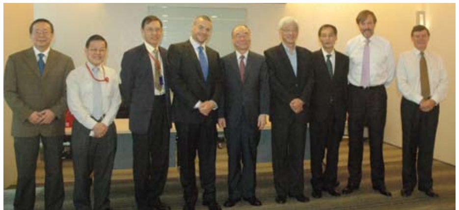
An important occasion for EMC and KPX