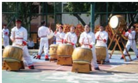
Taiko Drum Performance by SIA MINDS

On 24 February, EMC celebrated Chinese New Year with the clients at MINDS AMK. This year marks the first time SIA MINDS Employment Development Centre joined MINDS AMK for their Chinese New Year celebration. SIA MINDS runs vocational training programs for clients 18 years and older.