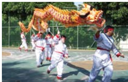
Dragon Dance performance by SIA MINDS

SIA MINDS started the celebration with a spectacular dragon dance, followed by an eye-opening Taiko drums performance: