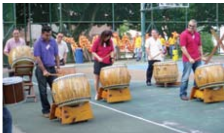
Volunteers, parents and guests trying out the Taiko drums